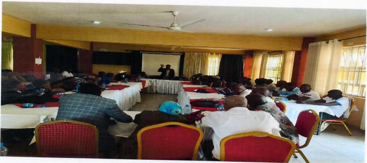
Municipal Board Chair Addressing the Stakeholders

Board chair welcomed all the participants and thanked them for honoring the invitation. He emphasized the importance of the citizen participation in decision making in local development planning. Board Chair added that citizen participation is a constitutional right that gives members of the public chance to contribute, challenge and participate in development planning aimed at achieving sustainable development. Chair appreciated the participants present and welcomed them for a fruitful and active engagement to review, get implementation update of the issues raised during the previous public forum and also get new ideas from the members of the public in regards to service delivery by the Municipality. Chair declared meeting officially opened and invited Deputy Municipal Manager (on behalf of Ag. Municipal Manager) to give an update of the proposals/challenges raised by the members of the public during the previous public forums held on 23 rd May and 25 th September 2025.