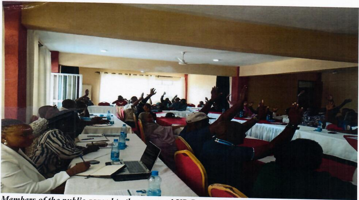
Members of the public agreed to the proposed UDG project by show of hands