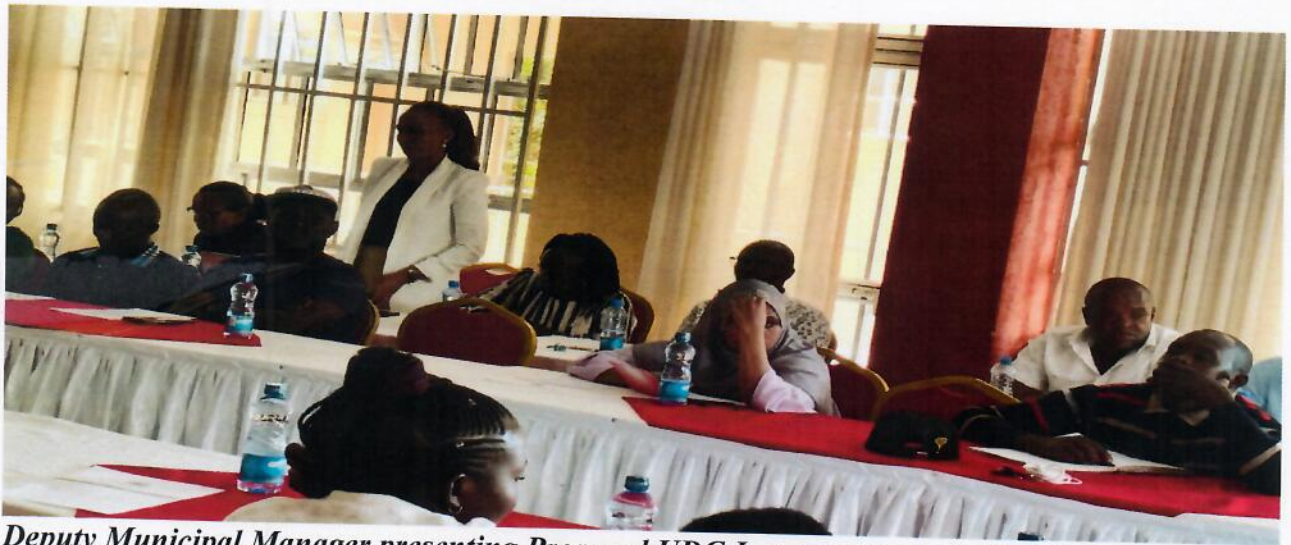
Deputy Municipal Manager presenting Proposed UDG Investments to the Stakeholders

There was a lengthy discussion on the above issue members of the public and especially those from other markets as to why Kitui town and yet it benefited in the first Phase of KUSP projects. To address these concerns, board chair other local leaders intervened acknowledge the valid concerns raised and promised to considered other markets in other wards within the Municipality not only in KUSP/ World Bank projects but also Kitui Municipality projects. After a lengthy discussion among the participants on the matter, members of the public agreed to the proposed projects.